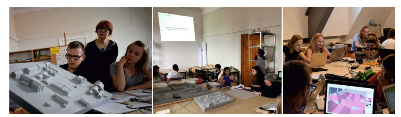
Figure 4: Student participatory, design workshop within the optional seminar Marketplaces/Social Spaces , for Master students, GUT, June 2019 (Photographs by J. Borucka and A. Benedetti).

The course was organised in the form of a block (one-week) seminar and workshop. It concerned the preparation and implementation of creative concepts in public spaces (urban solutions and architectural interventions) related to the issue. It was planned as interdisciplinary group work. Around 30 students were divided into small groups, each working on creative solutions for the Polanki marketplace in Gdańsk-Oliwa (Figure 4).