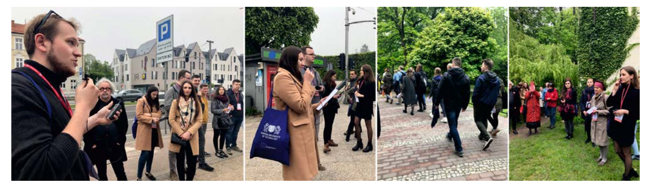
Figure 3: Student preparatory, participatory workshop Jane's Walk/Market Walk within the participatory planning course, for Master students, GUT, May 2019 (Photographs by J. Borucka).

For the students, it also created a solid theoretical and practical base for the participatory design activities [22][23].